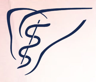
Medical Section at the Goetheanum